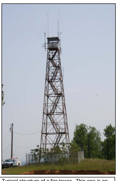
Typical structure of a fire tower. This one is on Carter Mountain in Albemarle County, Va.

was of his camp and the men's discipline. He stated that "92 percent of the personal [personnel] was native to Virginia."<sup>9</sup>