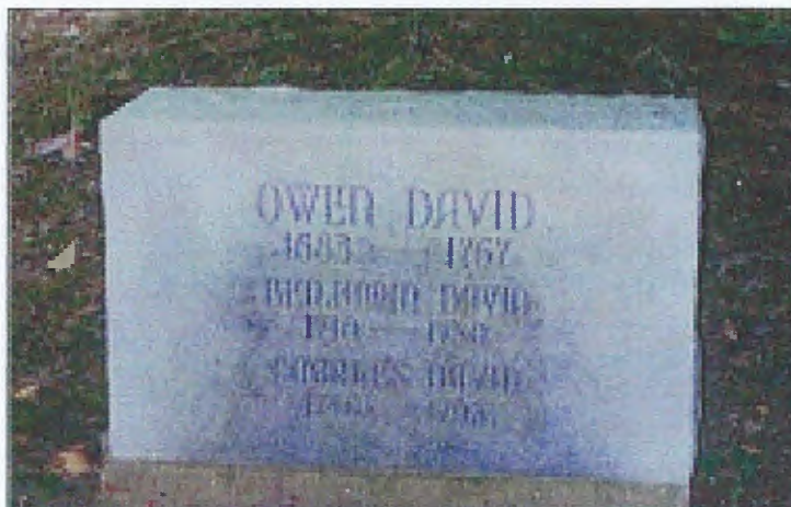
David Family Cemetery